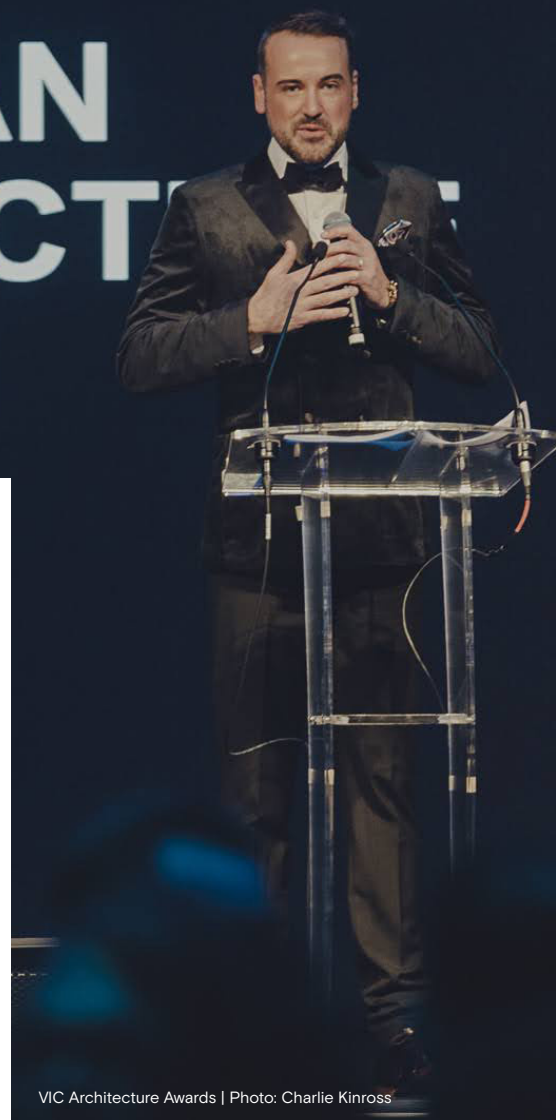
VIC Architecture Awards

This event will also celebrate the Victorian Architecture Awards winners, Partners, Prizes and the contribution Life Fellows and Past Presidents have made to the Victorian Chapter and the architectural profession.