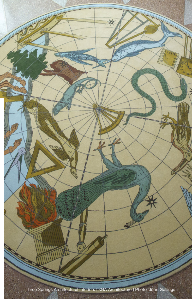
Three Springs Architectural Interiors | KGA Architecture