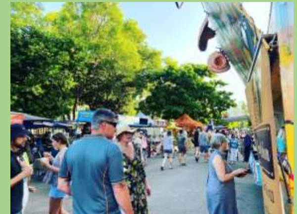
Mindil Beach Sunset Market with human interaction