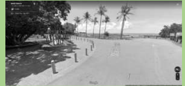
Mindil Beach Sunset Market without human interaction