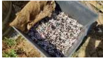
Shredded paper for community compost garden