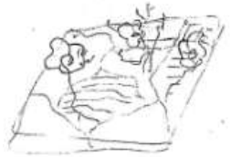
Surplus of paper compressed for reusable paper