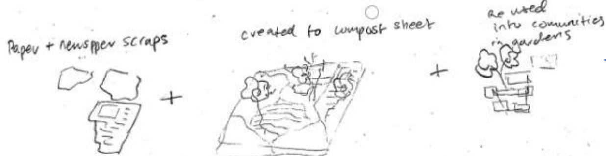
General regenerative design process