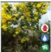
Figure 2: Acacia dunnii