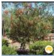
Figure 1: Callistemon "Kings Park Special"