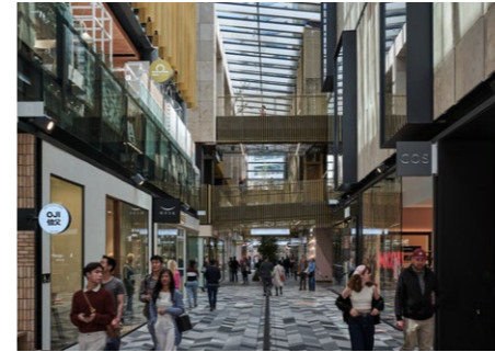
COMMERCIAL ARCHITECTURE COMMERCIAL BAY – TE TOKI I TE RANGI WARREN AND MAHONEY WITH WOODS BAGOT AND NH ARCHITECTURE