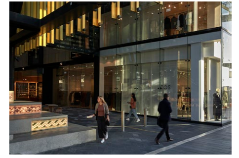
PUBLIC ARCHITECTURE COMMERCIAL BAY – TE TOKI I TE RANGI WARREN AND MAHONEY WITH WOODS BAGOT AND NH ARCHITECTURE