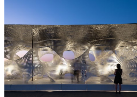
URBAN DESIGN YUANDANG BRIDGE BREARLEY ARCHITECTS + URBANISTS BAU