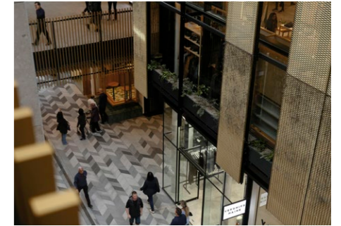
INTERIOR ARCHITECTURE COMMERCIAL BAY – TE TOKI I TE RANGI WARREN AND MAHONEY WITH WOODS BAGOT AND NH ARCHITECTURE