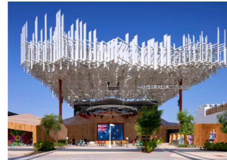
PUBLIC ARCHITECTURE AUSTRALIAN PAVILION, EXPO 2020 BUREAU*PROBERTS PHOTOGRAPHER: PHIL HANDFORTH