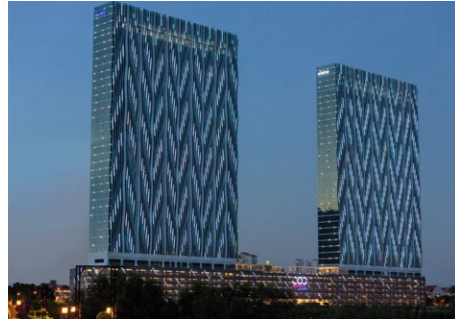
RESIDENTIAL ARCHITECTURE - MULTIPLE HOUSING CITY OF DREAMS CHT ARCHITECTS