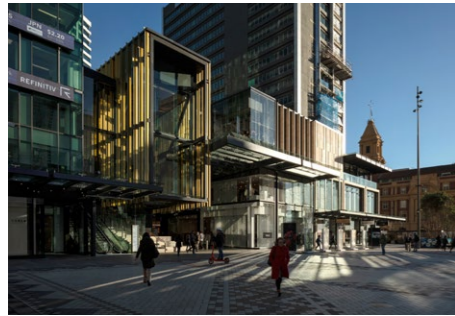
URBAN DESIGN COMMERCIAL BAY WARREN AND MAHONEY WITH WOODS BAGOT AND NH ARCHITECTURE