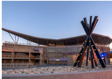
SUSTAINABLE ARCHITECTURE AL DANA AMPHITHEATRE S/L ARCHITECTS WLL

INTERNATIONAL CHAPTER ARCHITECTURE AWARDS 2022