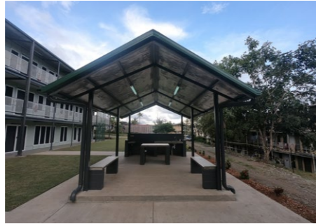
URBAN DESIGN FORCE SUPPORT BATTALION (FSB) BUILDING REFURBISHMENT PAWA ARCHITECTURE