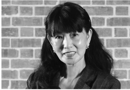
AR. DUTUK PEI ING TAN FRAIA