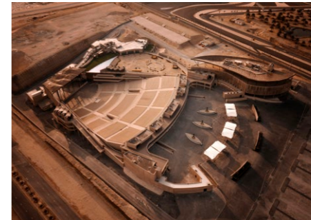
PUBLIC ARCHITECTURE AL DANA AMPHITHEATRE S/L ARCHITECTS WLL