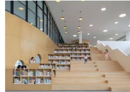
EDUCATIONAL ARCHITECTURE TIANYOU EXPERIMENTAL SCHOOL BREARLEY ARCHITECTS + URBANISTS BAU