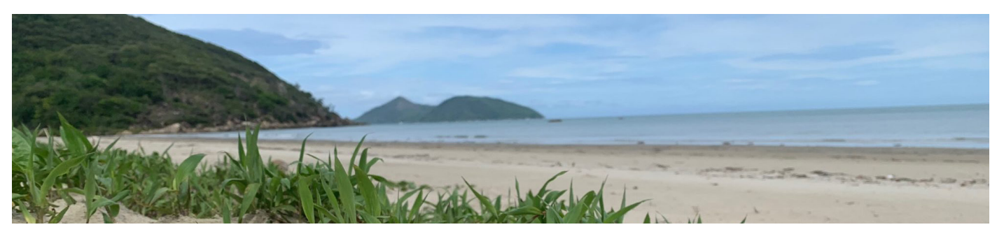
YARRABAH TOUR Sunday 27 October Half-day, morning

This tour offers a unique glimpse into the social and cultural history of the Yarrabah Indigenous community. The guided tour will be narrated by local elders. Located 60 kilometres from Cairns CBD the tour will pass the Yarrabah Arts Centre and School and other cultural sites.