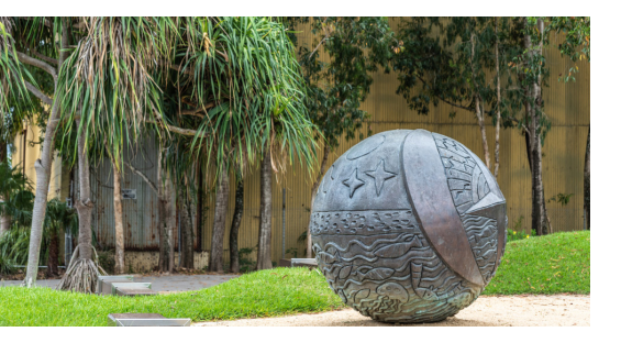
CAIRNS CITY TOUR Sunday 27 October Half-day, afternoon

This tour offers a unique glimpse into the social and cultural history of the Yarrabah Indigenous community. The guided tour will be narrated by local elders. Located 60 kilometres from Cairns CBD the tour will pass the Yarrabah Arts Centre and School and other cultural sites.