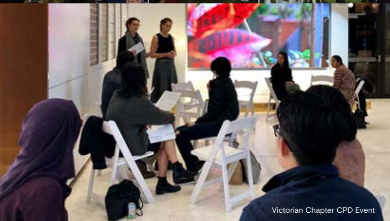
Victorian Chapter CPD Event

There are various opportunities available across our broad range of programs and events for a Victorian Partner to be involved in, including: