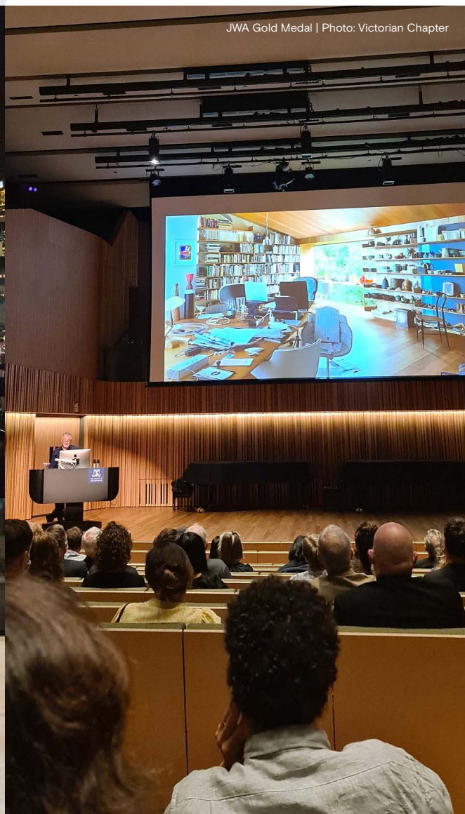
JWA Gold Medal | Photo: Victorian Chapter