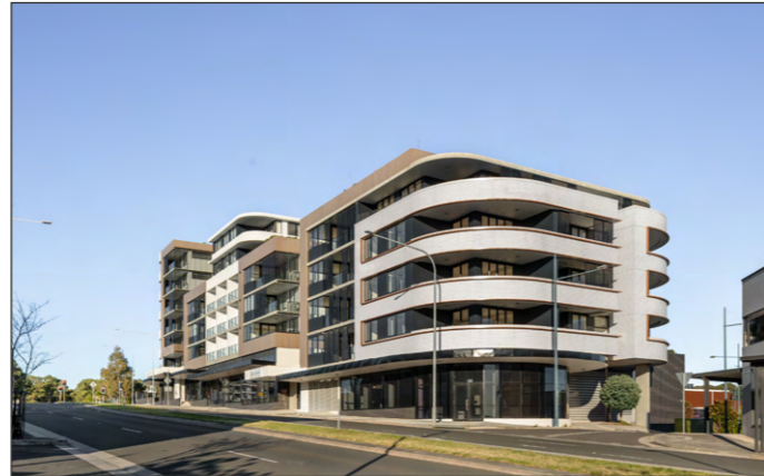
RESIDENTIAL ARCHITECTURE - MULTIPLE HOUSING