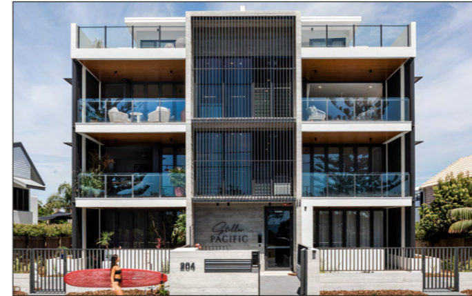
RESIDENTIAL ARCHITECTURE - MULTIPLE HOUSING