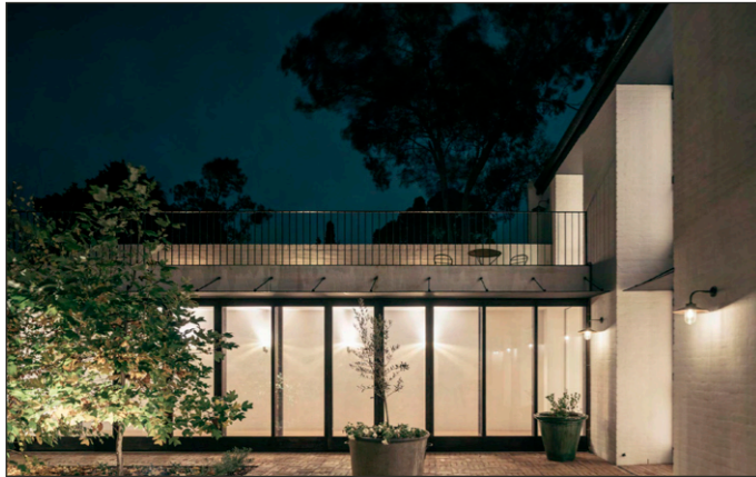
RESIDENTIAL ARCHITECTURE - HOUSES (NEW)