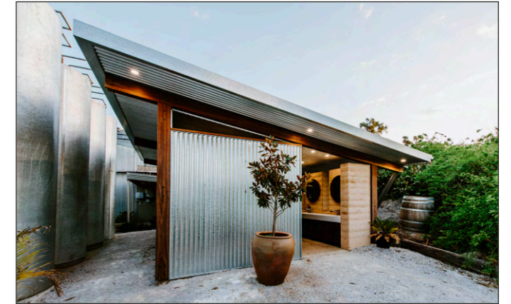
SMALL PROJECT ARCHITECTURE