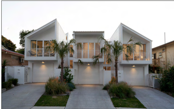
RESIDENTIAL ARCHITECTURE - MULTIPLE HOUSING