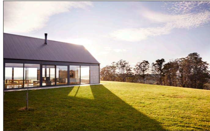
RESIDENTIAL ARCHITECTURE - HOUSES (NEW)