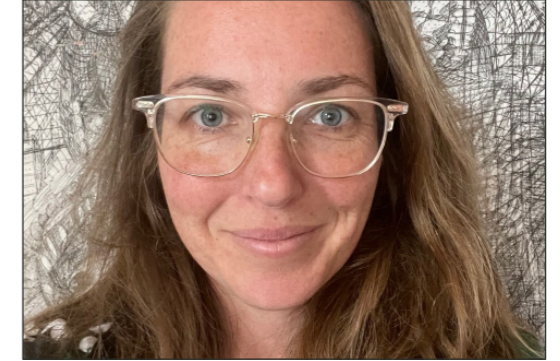
JO BASTIAN BASTIAN ARCHITECTURE