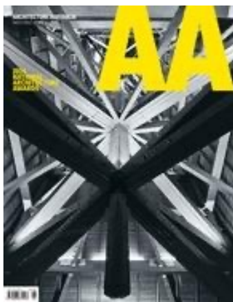
Architecture Australia 2014 National Awards edition