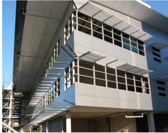
8 Brindabella Park, Canberra International Airport

Workshop Friday 11 November 7:45am Registration and Breakfast for 8:30am – 12noon