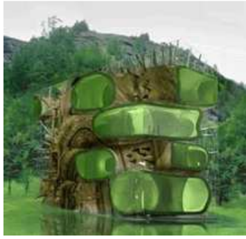
Above: waterflux by R&Sie(n);