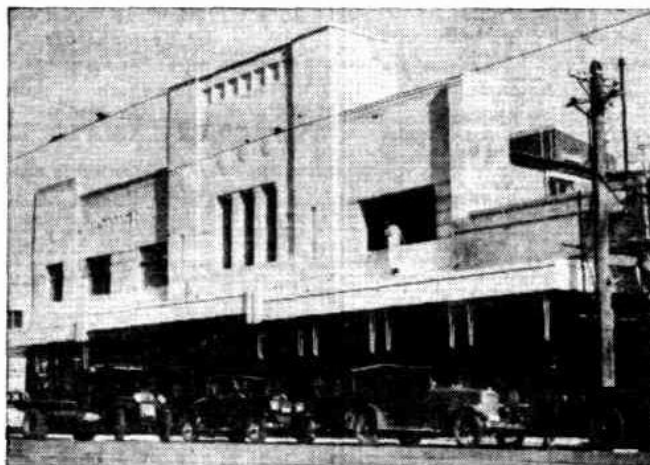
The remodelled State Theatre, shops and picture garden at the corner of Walcott and Beaufort streets, Mt. Lawley, which will be reopened in about two weeks. The architects are Messrs. Baxter-Cox and Leighton.