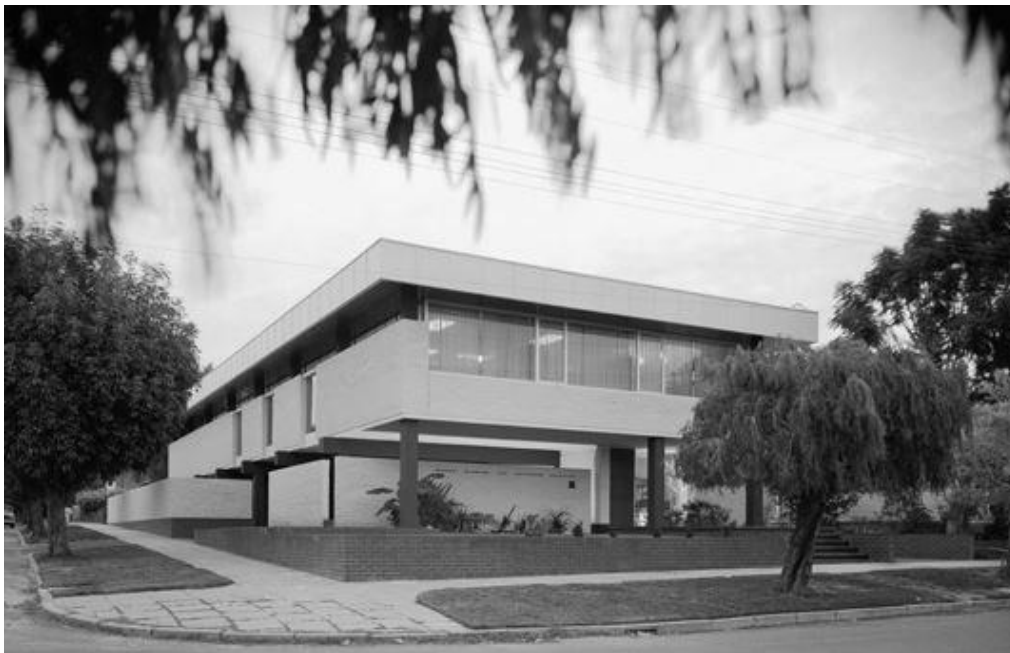
Hobbs Winning & Leighton offices, 37 Ord Street West Perth in 1966 (SLWA 340824PD)