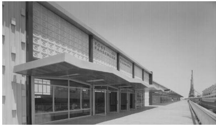
Fremantle Passenger Terminal 1962 (SLWA 340518PD),