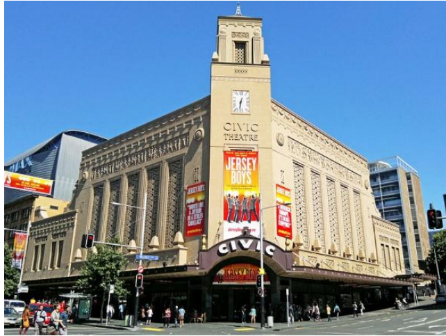
Civic Theatre, Auckland completed in 1929 (Wikipedia 2013).