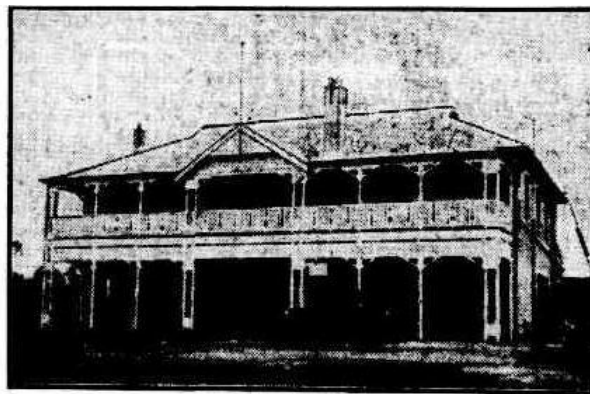
NEW HOTEL AT ARDATH.