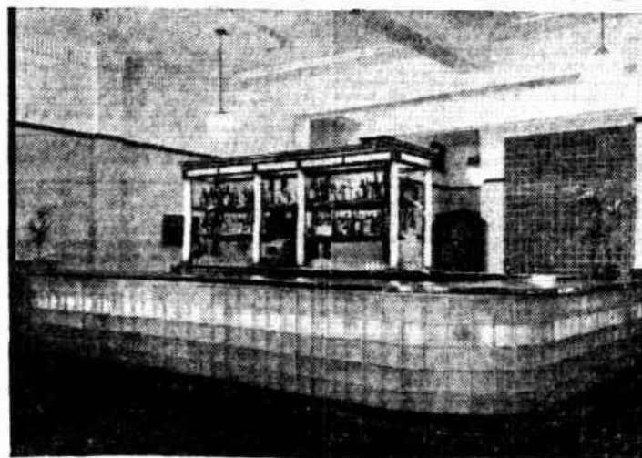
An example of the use of illuminated glass bricks and illuminated glass stanchions and dome of the Amat-ice canopy in the saloon bar of the Palace Hotel, Kalgoorlie. Improvements costing £10,000 have recently been completed at the hotel. The architect was Mr. W. G. Pickering.