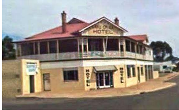
Lake Grace Hotel (1924)