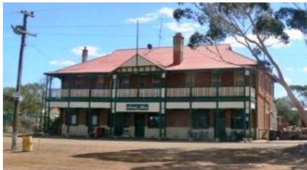
Ardath Hotel for F.W. Jacoby 1925 ( www.publocation.com.au accessed 2014)