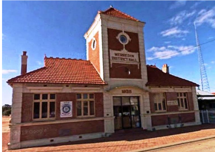
Merredin District (now Town) Hall 1925 (Google 2013)