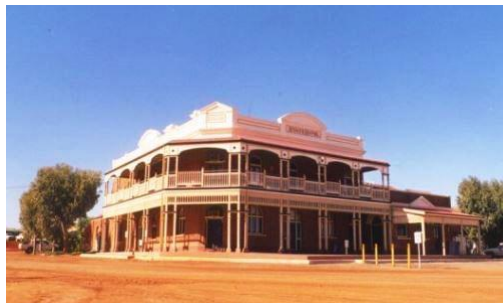
State Hotel at Gwalia of 1903.