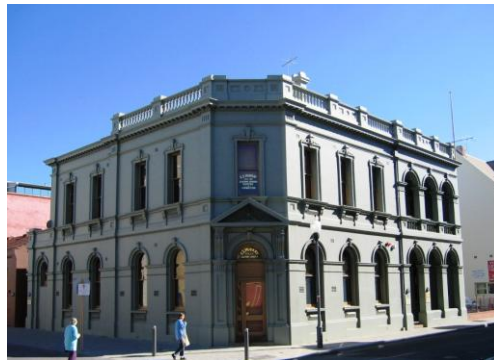
Union Bank of 1889 on the corner of High and Cliff Streets, Fremantle