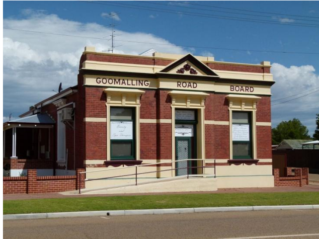
National Bank Goomalling ( http://www.mingor.net/localities/goomalling.htm )