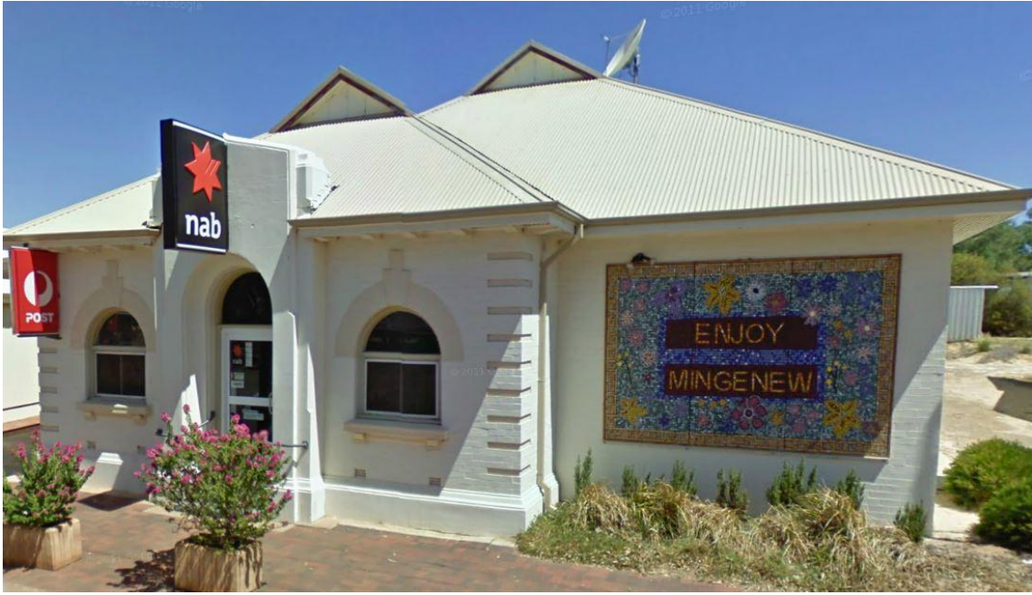
National Bank Mingenew (Google 2013)