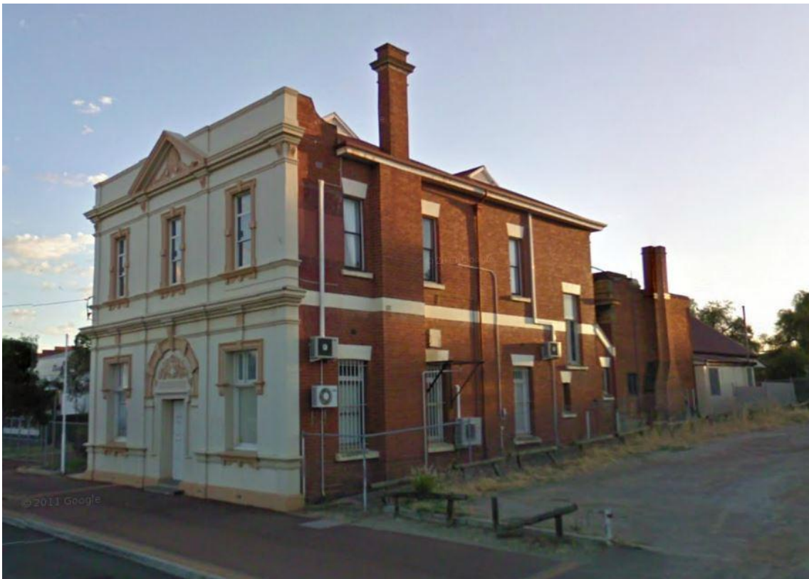
National Bank Northam