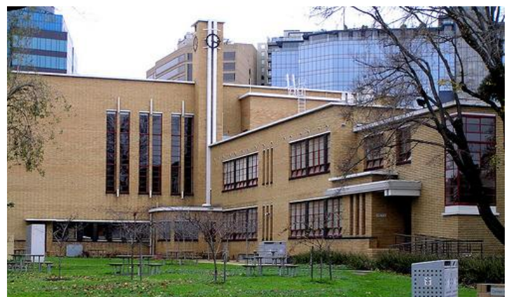
View from West