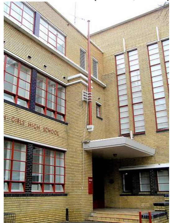
North East Entrance