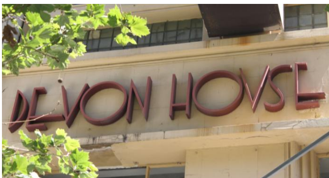
Philip Griffiths Architects 2010