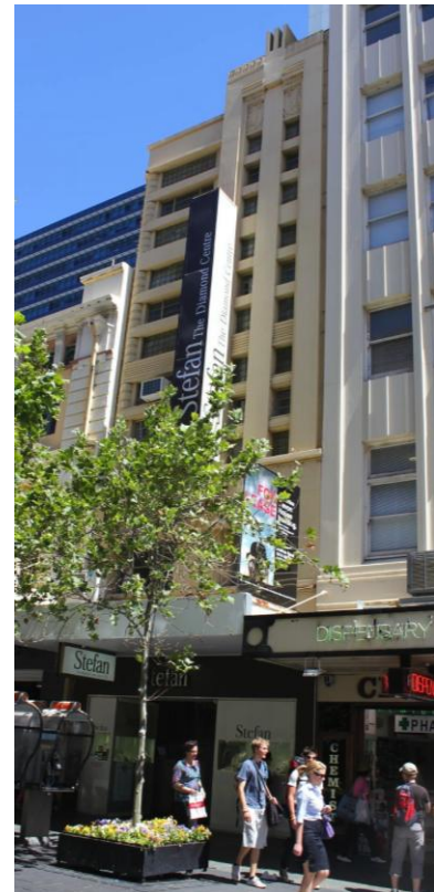
Philip Griffiths Architects 2010