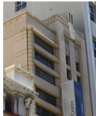
Philip Griffiths Architects 2010